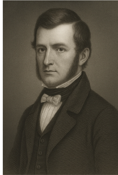
William Billings (1746-1800) composer