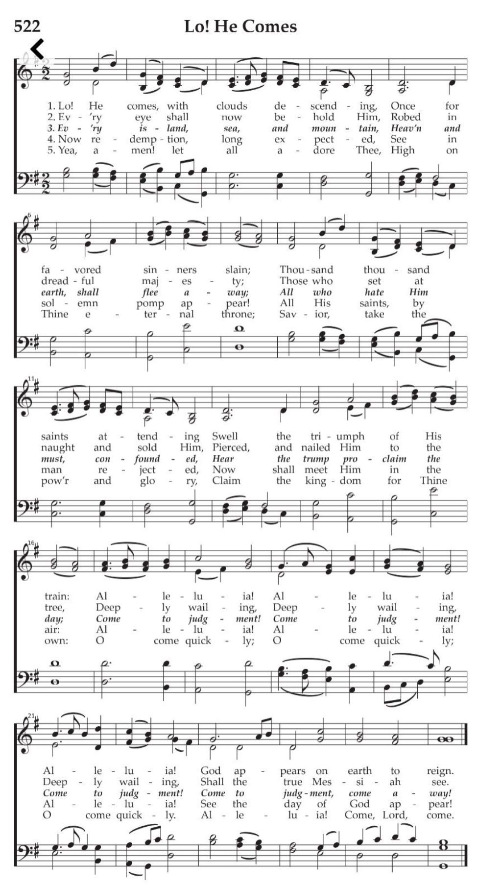
Hymn – "Lo, He Comes!" (see below)