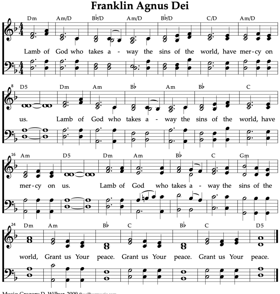
Music: Gregory D. Wilbur, 2009 © wilburmusic.com Text: Traditional; based on John 1:29